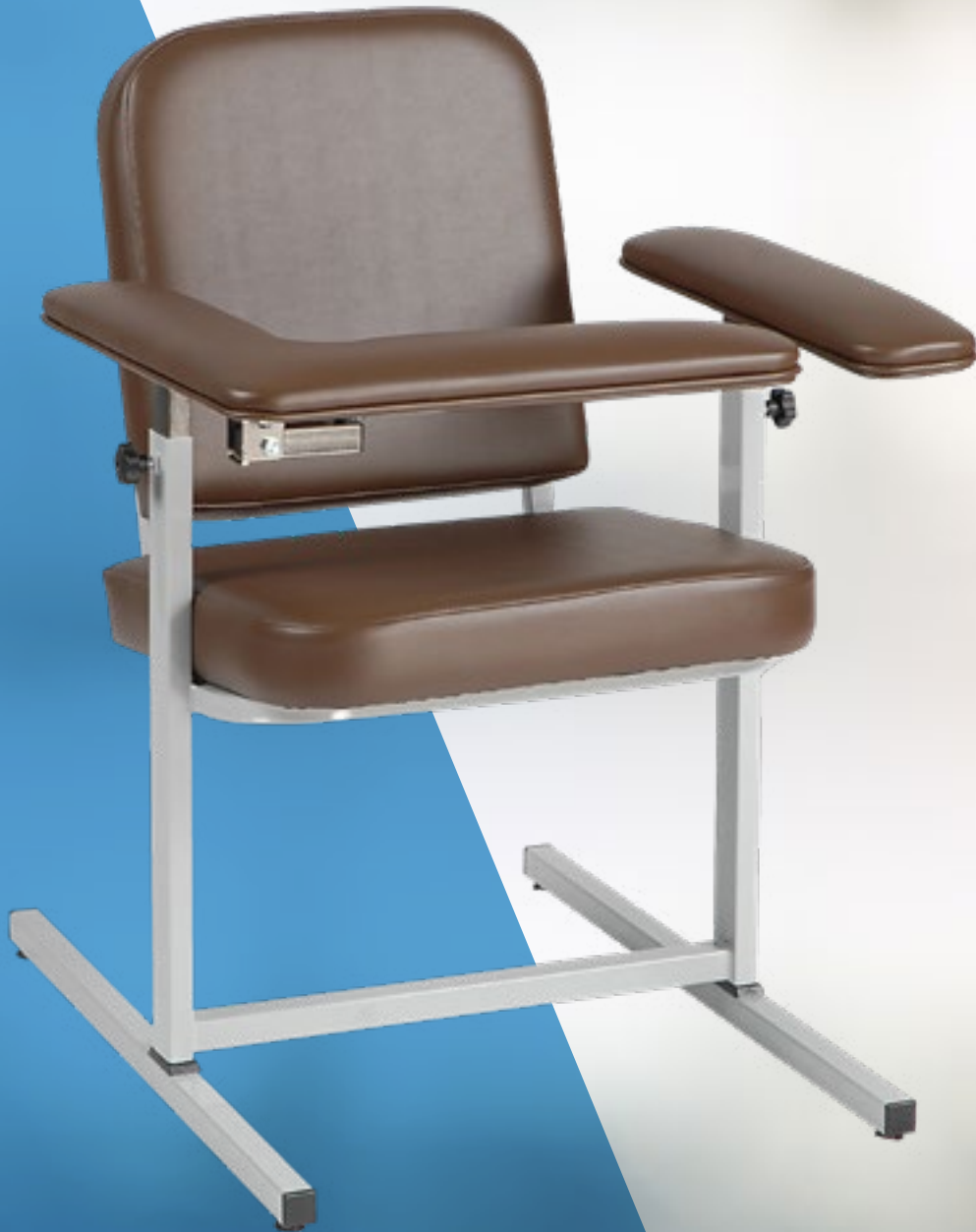
NARROW STANDARD HEIGHT BLOOD DRAW CHAIR 1202-LU/N