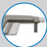
Sliding "L" Arm A1202-SLA