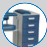
Storage Cabinet A1202-SC