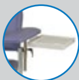
Folding Side Tray A1202-FT