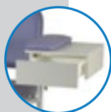
Storage Drawer, Laminated A1202-LD