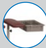
Side Tray A1202-CO