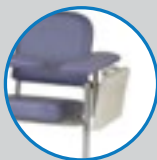
Folding Side Tray A1202-FT