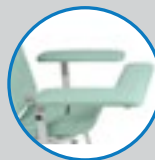
Sliding "L" Arm: A1202-SLA