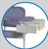
Laminated Storage Drawer A1202-LD