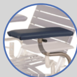
Second Arm Rest A2018-AR