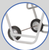
Wheeled Transport Kit (at time of order) JA2018-WK