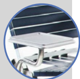
Supply Tray A2018-ST