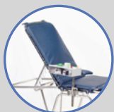
Lounge Pad (your choice of vinyl colors) A2018-LP