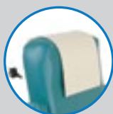
Head Cover A1556-HCF