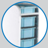
ABS Enclosure A1000-SK