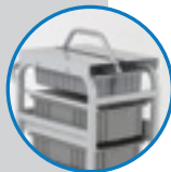
Phlebotomy Top A1000-PTT