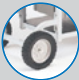
All-Terrain Wheels A1000-FW