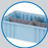
Drawer Dividers A1000-DD