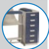
Six 3-1/2" Drawers A1202-SC