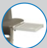
Folding Side Tray A1202-FT