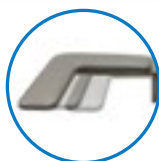
Sliding "L" Arm A1202-SLA