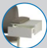
Storage Drawer, Laminated A1202-LD