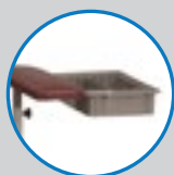
Side Tray A1202-CO